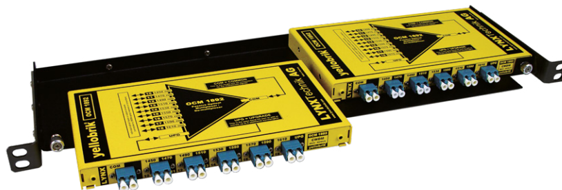
Optional RFR 1018 ½ RU 19" Rack chassis with 2 x OCM modules