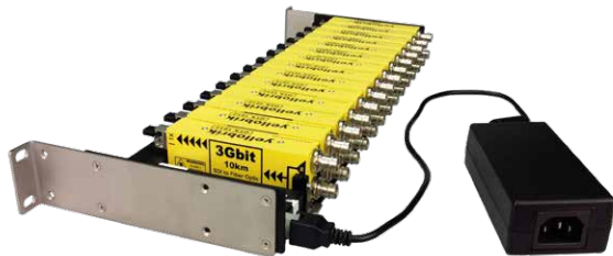
Power Supply RPS 1000-1

The supply provides regulated 12VDC @ 10A max, which is enough power for any combination of yellobriks.