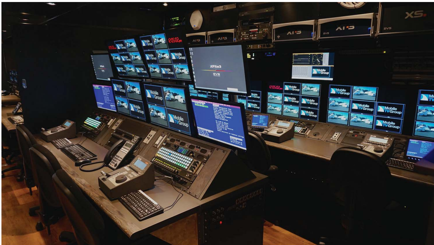
Colorado Studios / Mobile TV Group Replay Room in 37HDX truck

MTVG carries 56 signal paths on the yellobrik systems: 38 signals from the main mobile unit (MU) to the companion unit (VMU), and 18 from the VMU to the MU. The companion unit is fully networked to the main unit with extensive fiber connectivity. Yellobrik carries SDI links over fiber back and forth between the dual trucks to aid in the visual display monitoring of signals, deliver and receive embedded audio, and interface with a number of other systems in the main truck. The yellobrik's are interfacing with a large variety of equipment including cameras, switchers, routers, servers, multiviewers and graphics engines.