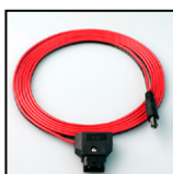
P-TAP 1000 Use with a standard battery P-TAP power source.

The kit INCLUDES AC power supplies. The power adapters below are optional.