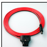
P-TAP 1000 Use with a standard battery P-TAP power source.

The kit INCLUDES AC power supplies. The power adapters below are optional.