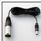
XLR 1000 Use with a standard 4 pin XLR camera battery power source.